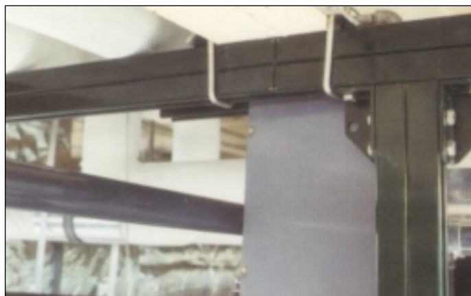
▲ The framing for the walkway is suspended from I-beams.

United Interlock® (also referred to as Interlock Grating) is a plank-type safety grating and platform material. Made of galvanized steel, or aluminum, the grating is light enough to be handled by two laborers without cranes or forklifts. Yet, because of its superior strength-to-weight ratio, Interlock Grating requires less support structure than other types of grating. The legs of adjoining planks lock together to form a structurally sound surface.