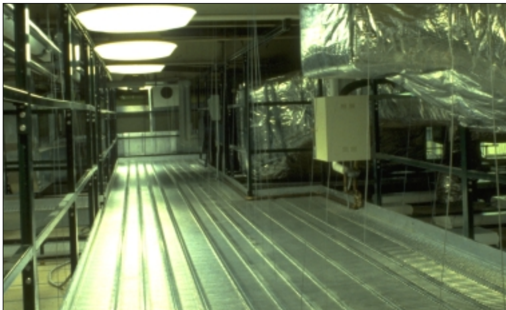
Number 3 Maintenance Walkway NCR Corporation Cambridge, Ohio

◀ The enclosed maintenance walkway is located above the ceiling of NCR's cleanroom and is constructed of United Interlock® Grating and Unistrut® Metal Framing.